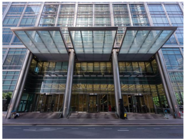
The entrance to the Citigroup Centre