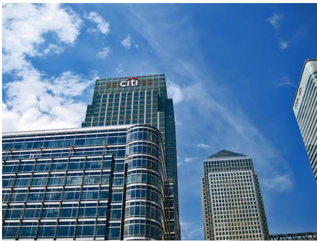
The Citigroup Centre building

We are on floor 25 of the Citi building.