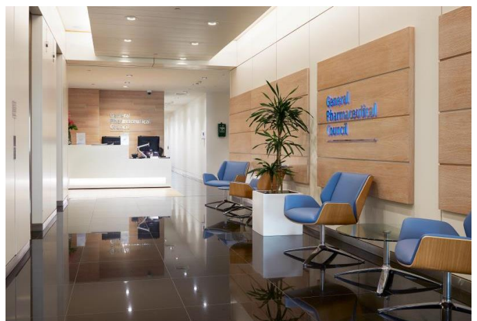
The Hearings Centre reception

Once you have your pass, a Citi Visitor Relations Officer will take you to the Hearings Centre.